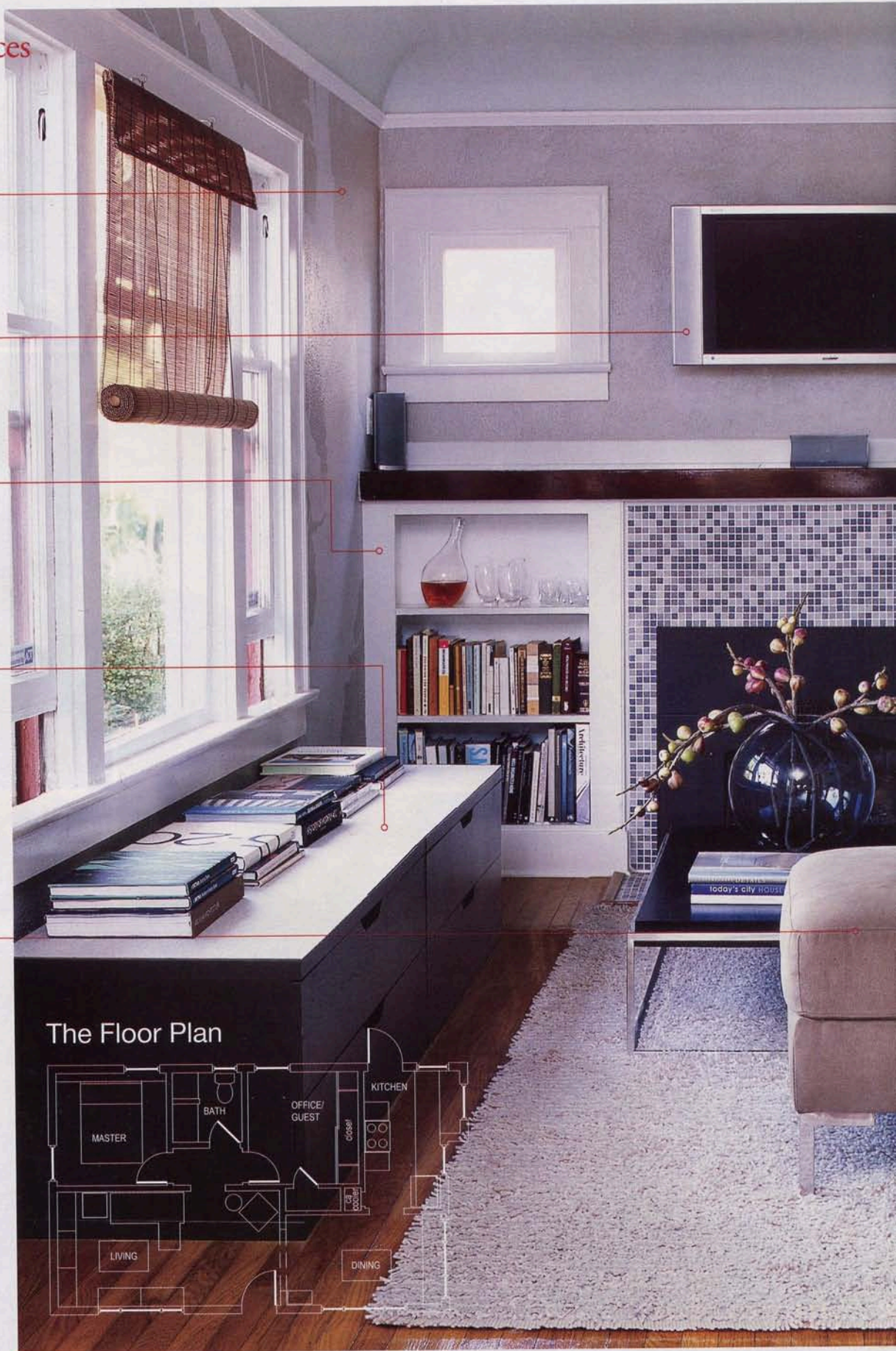
The Floor Plan

IDEA #38 She and Eric resisted the urge to fill a tiny room with lots of little furniture: One big piece, like this sofa-and-chaise combo, creates a room-within-a-room feel.